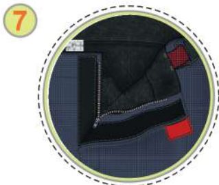
Front flap closed with velcro tape and zipper