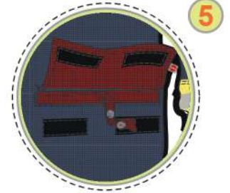
Pocket hanger tab with snap fastener