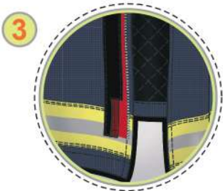
Ergonomic zipper pull tab for easy operation with gloves