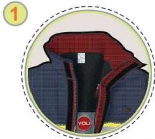
Quick-release (panic) zipper for rapid removal of the jacket in emergency situations