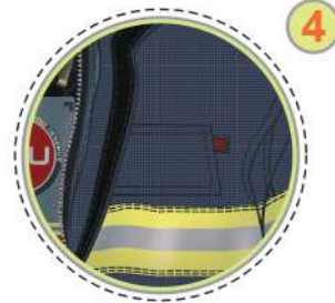
Radio pocket with height adjustment (also suitable for torch use)