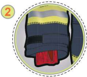
Adjustable cuff system