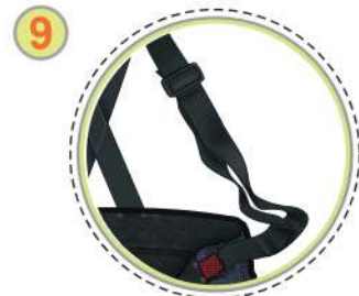
Adjustable suspender system with buckle