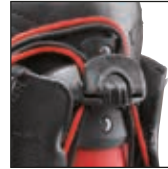
HAIX® FL Fit System