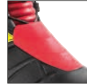
HAIX® 3Z Protector System