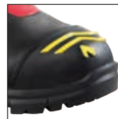
HAIX® High Durability Cap System