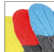
HAIX® Vario Wide Fit System