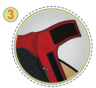
Front flap and collar