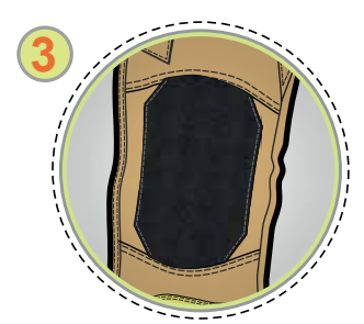
Wear resistant knee reinforcement with padding