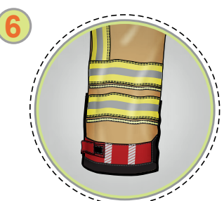
Trotter with reflective tape details