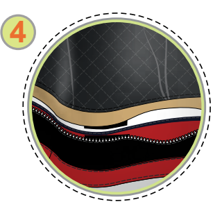
Antiwicking fabric to prevent fluid entry Water drain holes Inspection opening