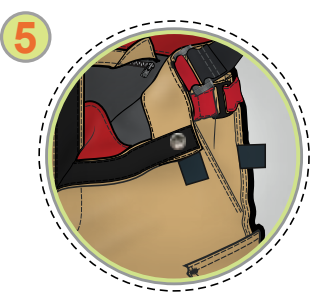
Side and inside pockets