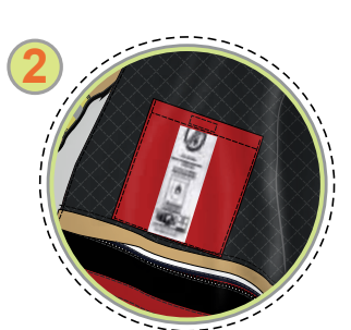
Washing label and inner pocket details