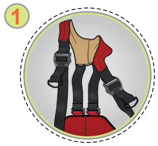
Adjustable and removable suspender system