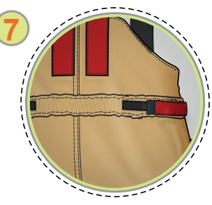
Adjustable belt system