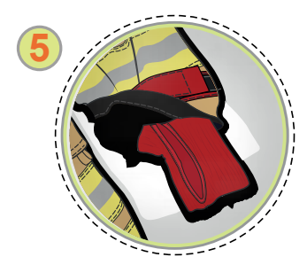
Arm end reinforcement