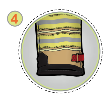
Trotters adjustable with velcro tapes