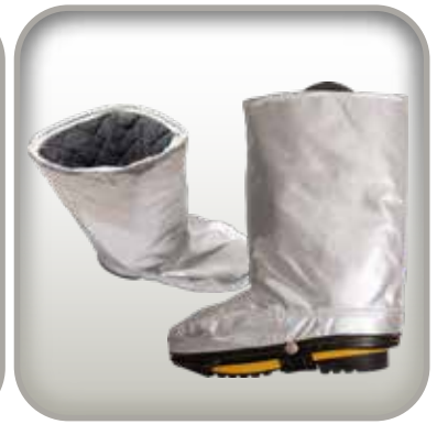
817101 - Curtis Gaiters