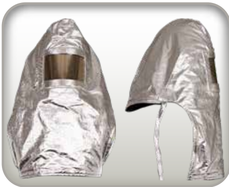
827100 - Wolf Shroud