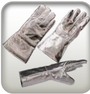
805100 - Tyler Gloves